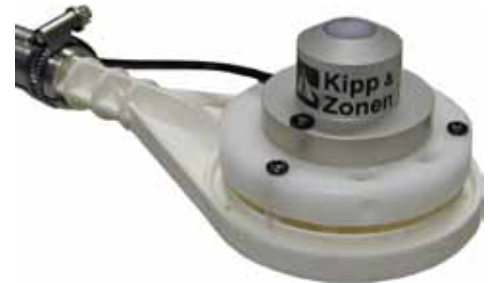
Pyranometer SP-Lite with mast mounting arm